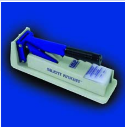
Silent Knight Pill Crusher Item #P1611