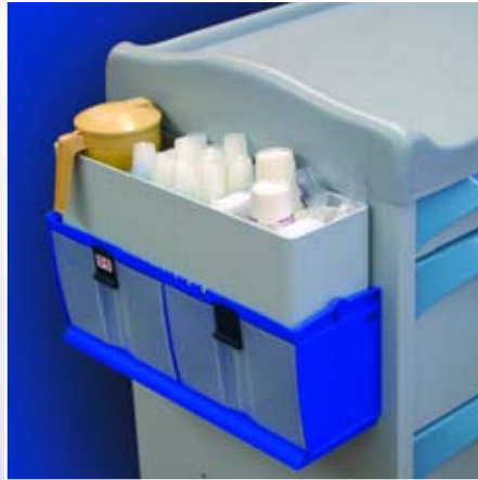
All Purpose Organizer Tray with Exterior Tilt Bin Organizer Holds spoons, cups, straws, etc. Tilt Bin Item #T2001