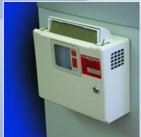
Sage Sharps Container Includes locking security feature. Item #S1802