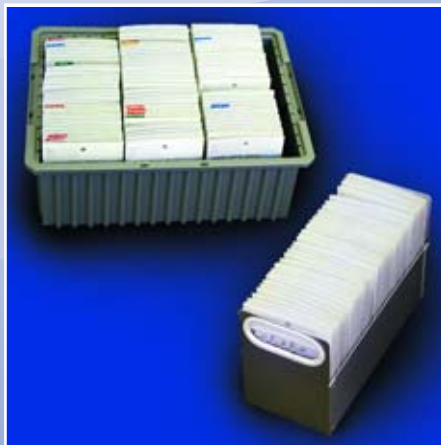
One and Three Row Exchange Bins One Row Item #B203 Three Row Item #B204