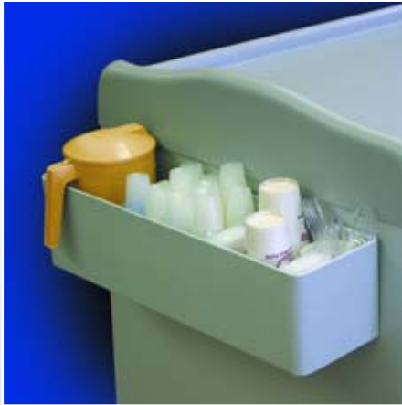
All Purpose Organizer Tray Holds cups, straws, etc. Attaches to the side of the cart. Place on work surface for easy access. Fits perfectly on top of Exterior Tilt Bin Organizer. Item #01501

Customize your cart by specifying the following options: